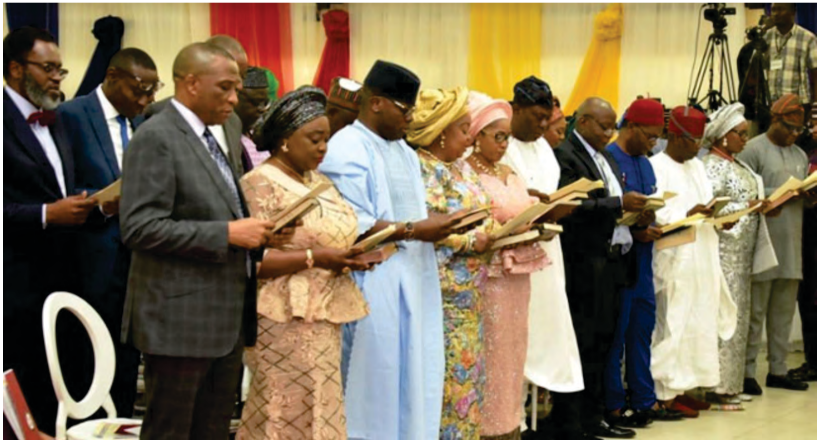
Lagos State EXCO

"No political appointees at any level shall be a voting delegate or be voted for at the Convention or Congress of any political party for the nomination of candidates