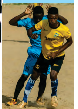
Oloke FC VS Lofty Skills SA

Oloke FC also book a place in the next round of the Notayo's Cup Competition as the boys are gradually been separated from the men.