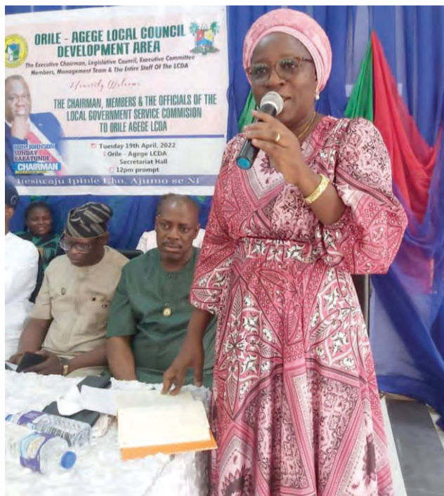
LGSC officials orientating Orile-Agege council staff

earnest. She advised all members of staff to go to their duty post whenever they are redeployed and that every member of staff should be familiar with the civil service rule, particularly, on discipline, appointment, misconduct amongst others.