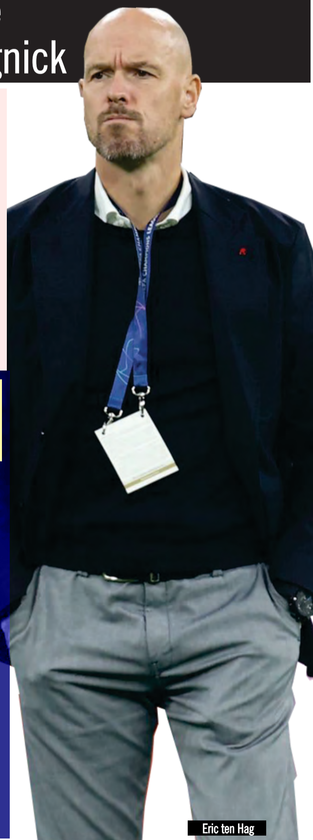
Eric ten Hag

"It can happen within one year. Other clubs have shown it's possible within three transfer windows."