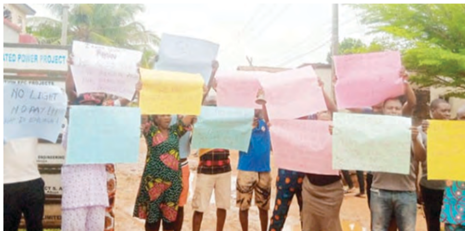
Peaceful protest demonstration against Ikeja electric