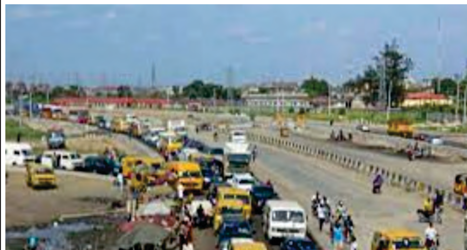
Mile 2, Lagos

They advised the construction company to engage stakeholders, especially Lagos State Traffic Management to help in the direction of the traffic to avoid gridlock, robbery or accident in the area.