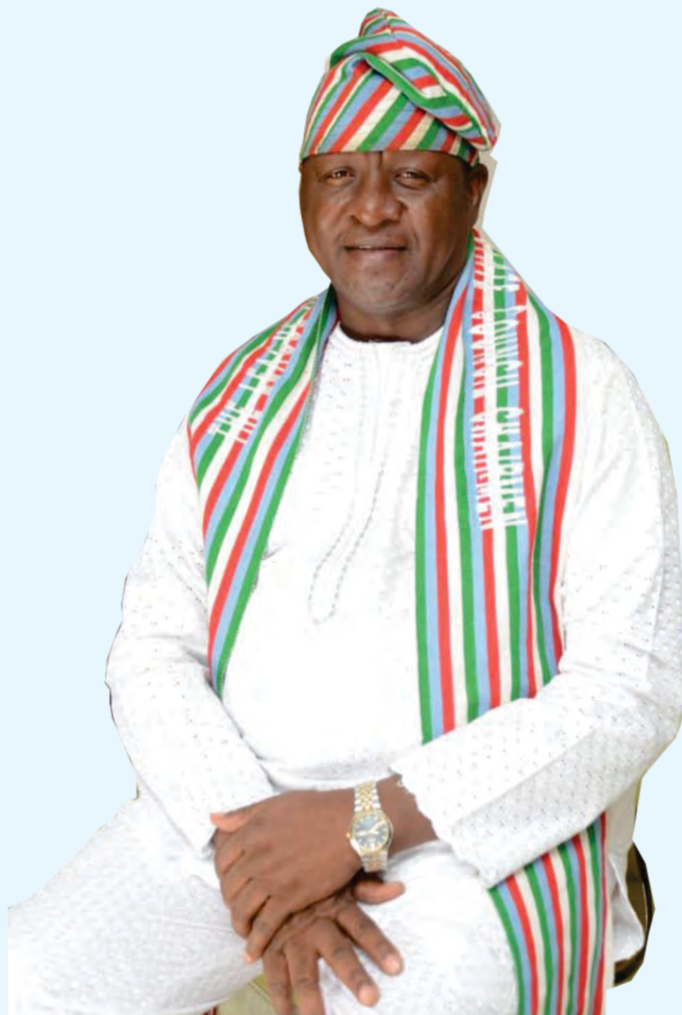
Hon. Kehinde Bamigbetan

Even though the Federal Government still relates with Lagos State based on the original