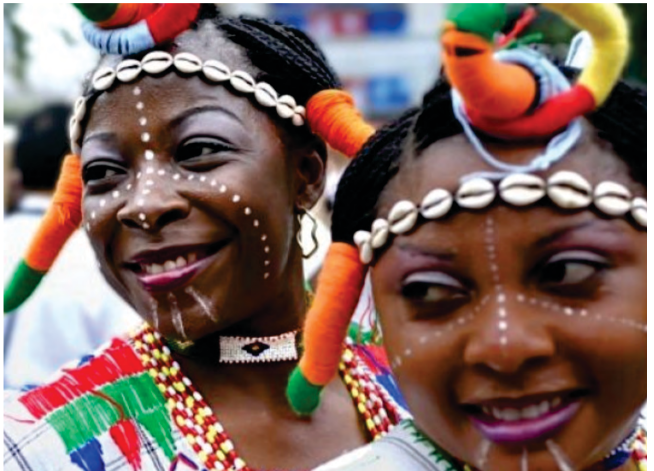
Women dressed colourfull attire

"Children should be brought up to be responsible to